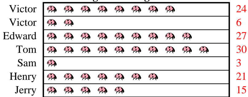
Bug Catching Contest